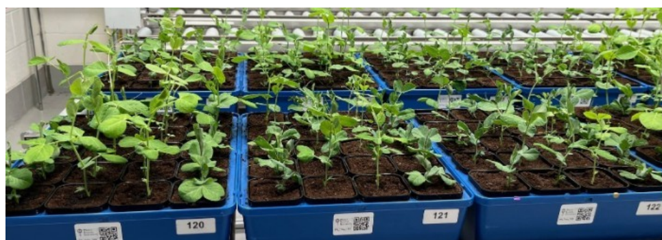
Growth varies considerably between pea accessions with varying soil water content (SWC).

Climate modelling from the Met Office predicts drier and hotter summers, especially in the East of England where peas are grown. Last year, the spring drought had a devastating effect on pea crop yields. With the aim of improving drought tolerance, we have screened a total of 260 genetically diverse pea varieties. This was done at the fully automatic National Plant Phenomics Centre in Aberystwyth. The pea seedlings move around on conveyer belts, are given precise amounts of water and weighed regularly to see how much water is used. The screen identified germplasm with contrasting performance both in terms of growth rate and water use efficiency under control and two water-limiting conditions. Initial bioinformatics analysis uncovered genetic changes that can be directly incorporated into breeding programmes.